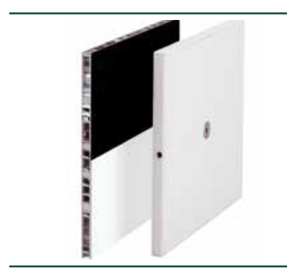
Lightweight and rugged for lab and field applications.